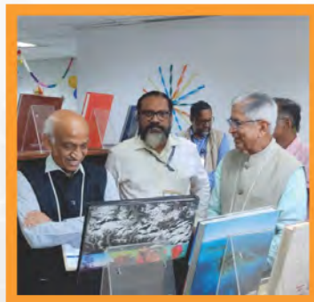
Gift of Wisdom - Book Exhibition