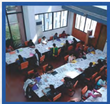
Workshop on Paper Crafts