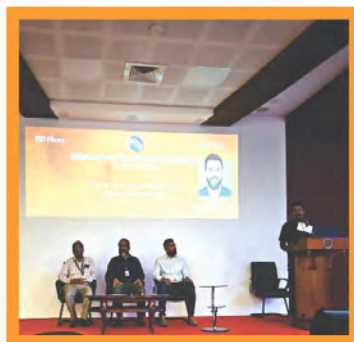
Book Workshop on Engineering Village.