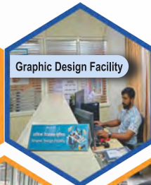
Graphic Design Facility