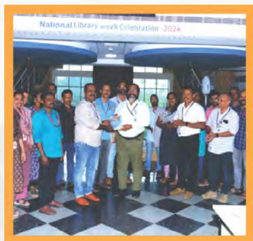
Book Donation Programme.