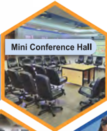
Mini Conference Hall